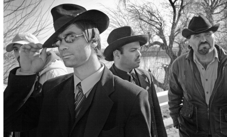
Some examples of pictures from the author.